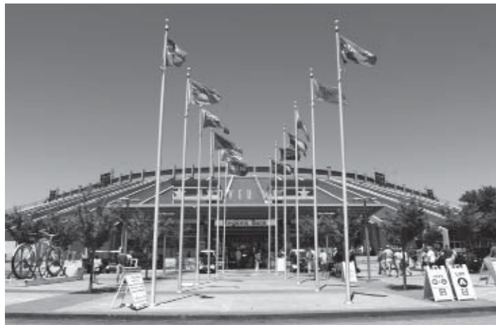
2014 SEC Tournament • Hoover Metropolitan Stadium • Hoover, Ala.